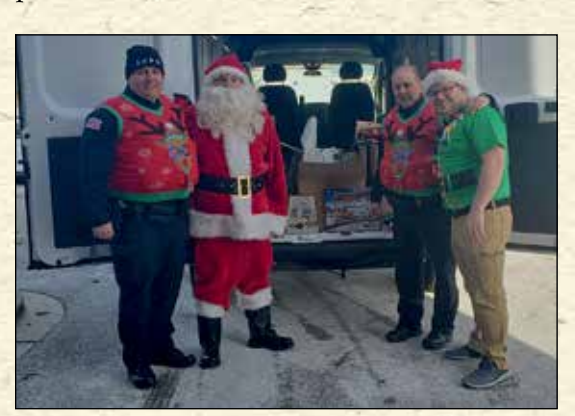
Annual Toy Drive

Finally, we are fortunate that our community does not have a high crime rate. However, we have experienced minor issues from time to time. I ask you to help us keep you safe. If you see something, say something. Working together we can continue to make Orland Hills a great place to live.