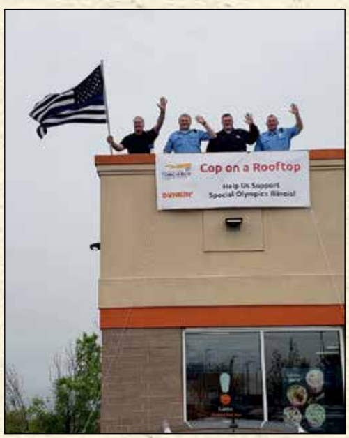
Cop on a Rooftop