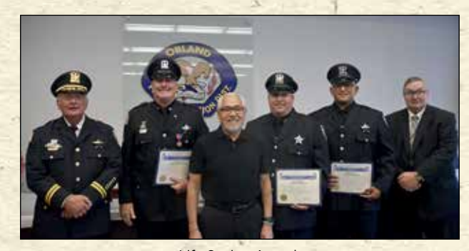
Life Saving Awards