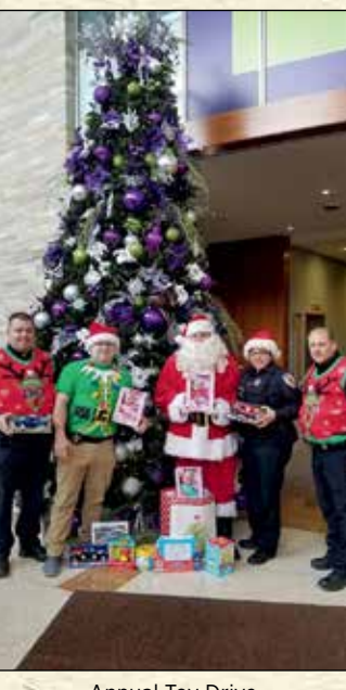
Annual Toy Drive